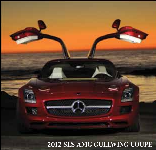
2012 SLS AMG GULLWING COUPE