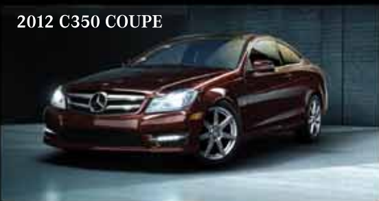
2012 C350 COUPE