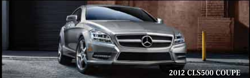
2012 CLS500 COUPE